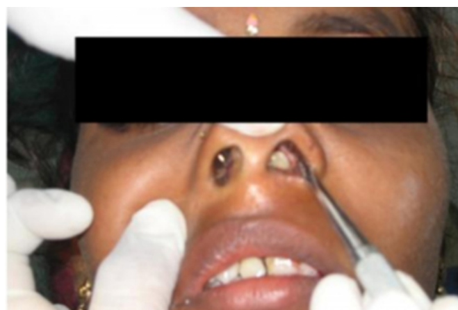
Figure 1 : Extra oral photograph showing a white mass in the left nasal cavity resembling a tooth.