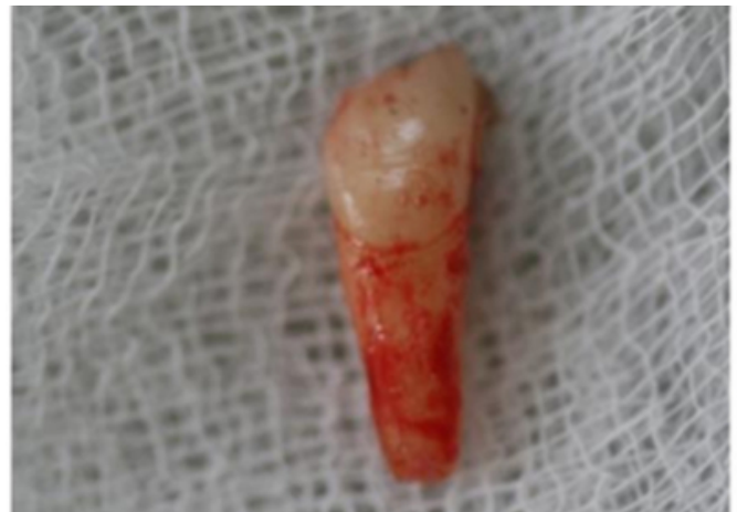
Figure – 8 : Photograph of the intruded left maxillary central incisor which was surgically removed