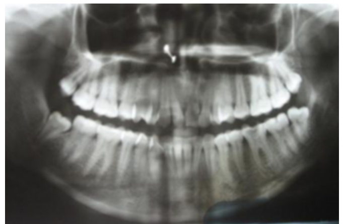
Figure – 5 : Post operative orthopantomogram