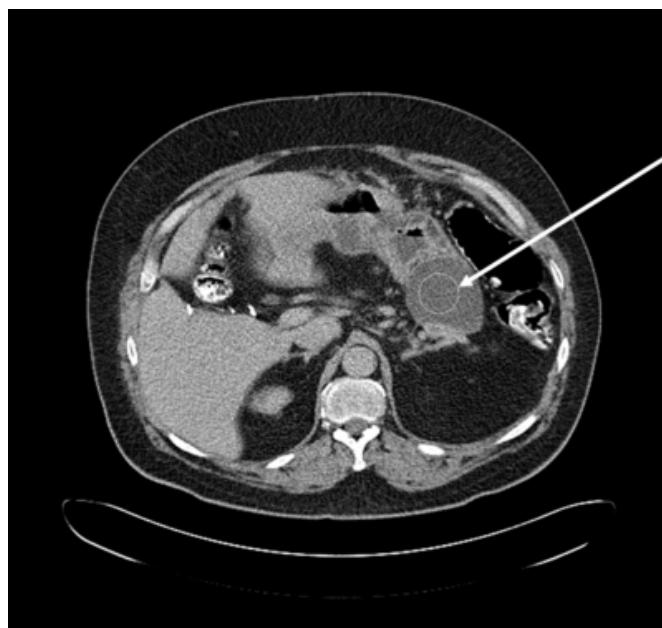
Figure 1: CT scan of left gastric artery pseudoaneurysm