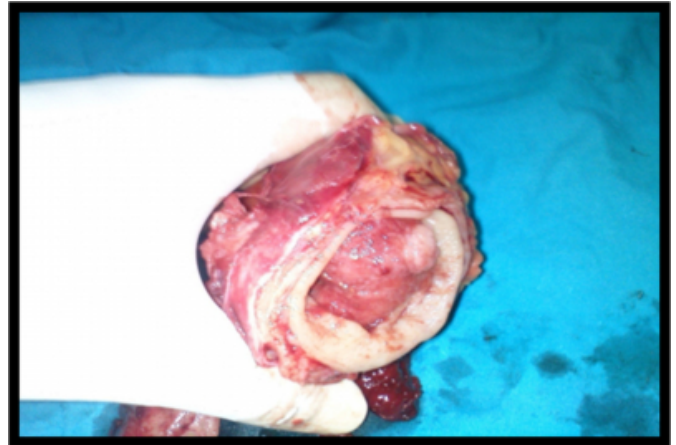
Figure 2: Specimen of rectum showing the rectal polyp

On histopathology, the polypoid rectal mass revealed well-differentiated mucin secreting adenocarcinoma (G1) infiltrating through the muscularis up to the serosa (T3). A lot of extracellular mucin was present in the rectal wall. Lymphovascular emboli and perineural invasion were also present. Both proximal and distal margins were free. Reactive lymph nodes were present. The Fallopian tubes were adherent to the mass.