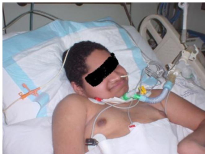
Figure 4: patient on Jan. 15 th 2005 in his hospital bed

On day 17 cervical fixation and stabilization (at spinal vertebrae C2-C3 the site of dislocation Fig 2) was done by the neurosurgeon. During operation the spinal cord was observed and found to be grossly disrupted.