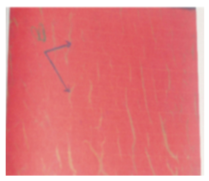
Fig. 1a: a section of the rat liver showing normal architecture of control rats