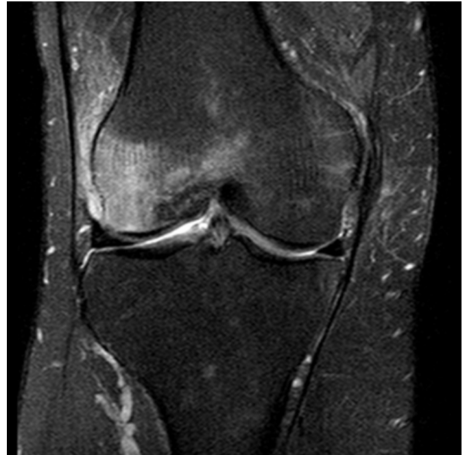
Image 3: SPONK of Lateral Femoral Condyle after Core Decompression