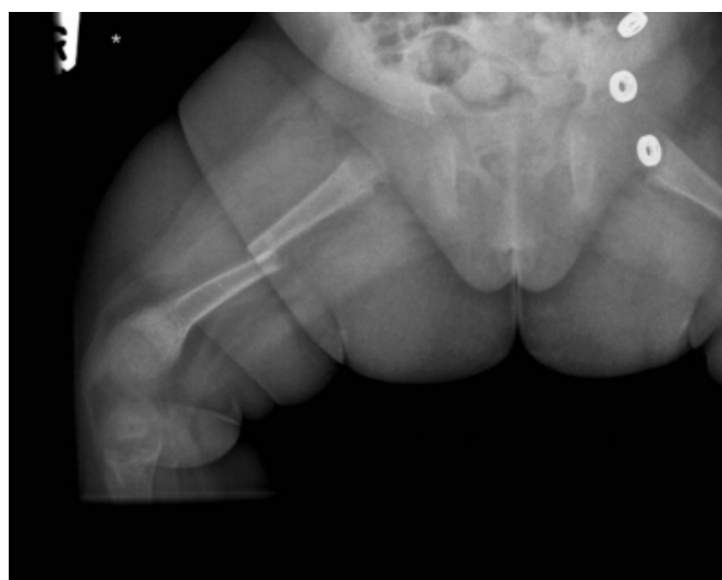
Figure 1: A plain radiograph of the right femur showing a displaced, transverse fracture through the mid shaft region. The underlying bone appears pathological, and there is evidence of periosteal new bone formation.

The child was subsequently placed in Gallows traction, a more detailed examination and history was conducted, and blood investigations were performed. At this stage child protection services were also involved due to the suspicion of NAI.