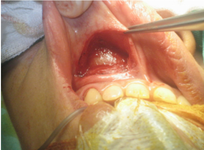
Figure 3: Intraoperative finding of right nasolabial cyst.

Other mode of treatment that had been described are simple aspiration, injections with a sclerosing agent, destruction by cautery, needle aspiration, and incision and drainage. However, these method are associated with high recurrence rates.