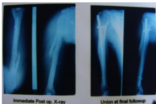
Figure 2- Immediate post op and at the time of union

Pain grading improved as the followup progressed but in patients where stiffness and impingement was a resultant complication, mild to moderate pain was recorded even at final follow up in 3 patients. Range of motion of both elbow and shoulder improved as the follow up progressed. None of our patients had elbow stiffness at the final assessment. Limitation of shoulder abduction <120^\circ was most common