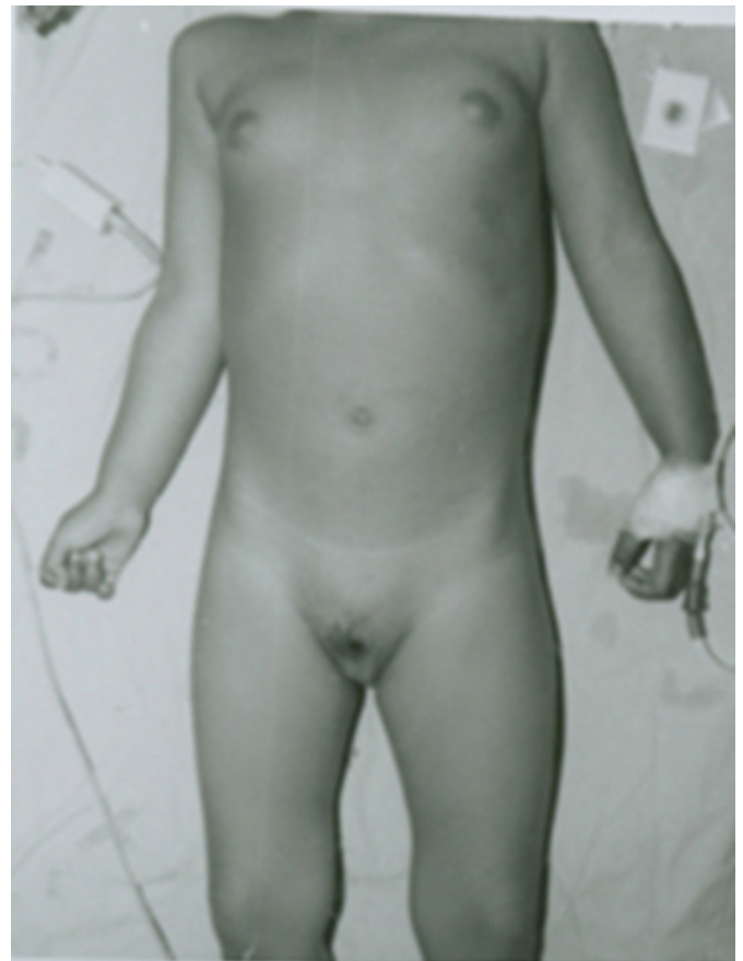
Figure 1: The patient at presentation showing gynaecomastia and pubic hair.

A wrist radiograph revealed a bone age of more than 3 years and less than 5 years. Ultrasonography of the abdomen