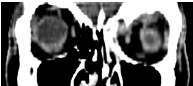
Figure 1b: Coronal CT scan showing soft tissue superomedially in right orbit and sclerotic expansion of the orbital roof.

A biopsy of the lesion taken by the ophthalmology team using an upper eyelid crease incision under local anaesthesia was non-diagnostic. The patient was referred to our otolaryngology team for assessment. We performed an endoscopic transethmoidal biopsy of the lesion (Fig 2).