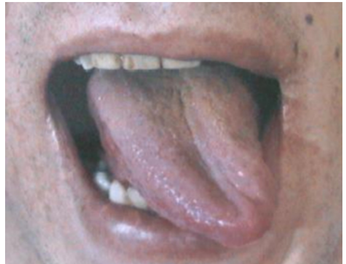
Figure 1: The tongue deviation to the denervated side during tongue protrusion and atrophy on the same side.