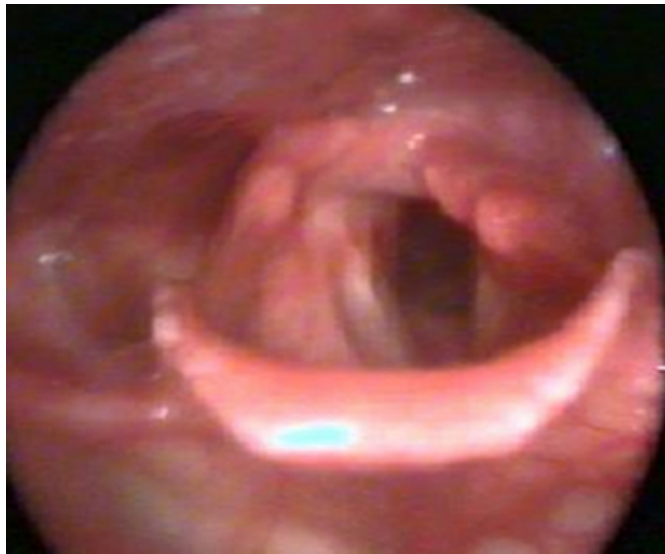
Figure 2: Left vocal cord paralysis

A x-ray scan of the neck revealed a lot of metallic round pellets that spreaded between the left zygomatic arc and the supraclavicular line (Fig 3 ). A computed tomographic (CT) scan confirmed the presence of multiple round metallic pellets, which was lodged within the posterior neck muscles and lateral portion of the neck (Fig 4). There were no signs of fluid or air accumulation in the neck. The CT scan excluded any damage to the neck structures. No signs of haemorrhage, abscess formation, tumour, ischaemia vascular pathology were observed in all the transverse sections.