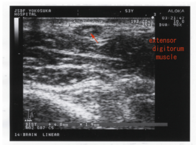
Figure 2: Echogram reveals a spiculate object within the low-echoic lesion above the extensor digitorum muscle (arrow).

The linear shadow that was revealed seemed to be longer and clearer than that of a dermoid cyst, which usually consists of hair and tooth. This tumor was extracted under local anesthesia. Histologically, it consisted of foreign body granulomas with a central abscess where a plant thorn of unknown origin was identified. Special stains did not confirm the presence of any particular organisms (Fig. 3).