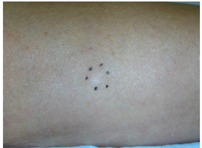
Figure 1: There is a small mass on the dorsal side of the right forearm (dotted line). No specific sign of the skin appearance can be indicated.

Its epidermal appearance was not peculiar. It had good mobility and showed no adhesion to his skin. The patient insisted that this tumor had appeared three months earlier but that he had felt no discomfort from it. He denied that there had been any trauma associated with it. We suspected the tumor of being a benign subcutaneous neoplasm like a neurofibroma. The preoperative US (SSD-5500 and UST5545 linear probe, Aloka, Tokyo, Japan) showed a low-echoic mass above the extensor muscle that included a high-echoic spiculate object (Fig. 2).