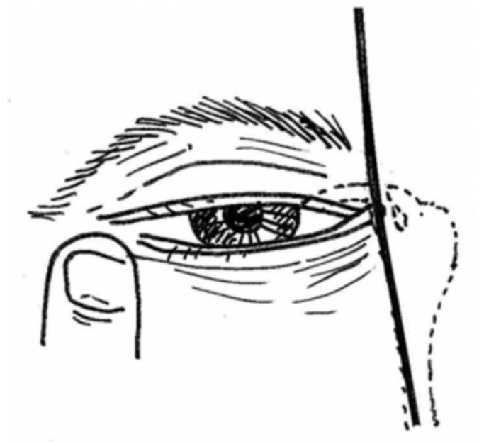
Figure 3: probing from lower punctum

The patient was sent home soon after the procedure with