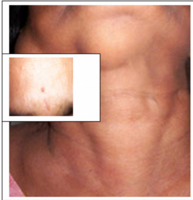
Figure 1: Multiple neck swellings & cutaneous lesions (inset )

Cytology from the parotid mass, submental swelling and thyroid lobe was reported as oncocytoma, lipoma and colloid goiter, respectively. Contrast enhanced CT imaging showed a well circumscribed enhancing lesion of the entire right superficial lobe of parotid gland extending into deep lobe (Fig.2). Enlargement and diffuse enhancement of left thyroid lobe was also seen. The cutaneous lesions on scalp and face were diagnosed by the dermatologist to be multiple fibrofolliculoma with a few melanocytic naevi. On these findings patient was diagnosed to be a possible case of Birt-Hogg-Dube syndrome. Ultrasonogram was performed to rule out any renal pathology known to be associated with this syndrome.