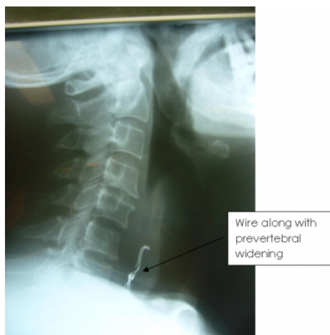
Figure 1: X-ray STN lateral view- Wire of denture at C, C level