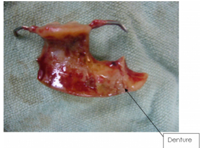
Figure 4: Artificial denture removed by Oesophagotomy

Post operatively intravenous antibiotics were continued for 10 days and nasogastric feeding am removac drain kept for 13 days. The suture was removed on 7 th postoperative days. The patient was discharged on the 14 th postoperative day without any problem.