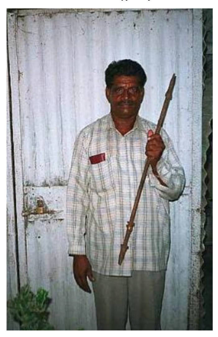
Image 1: The "specialist" proudly mentions that he knows what has to be done in a given type of pain and shows his instrument used to treat different types of pain.

While still in his village, the patient was treated by the "pain specialist" with a hot rod to "divert" his attention from the