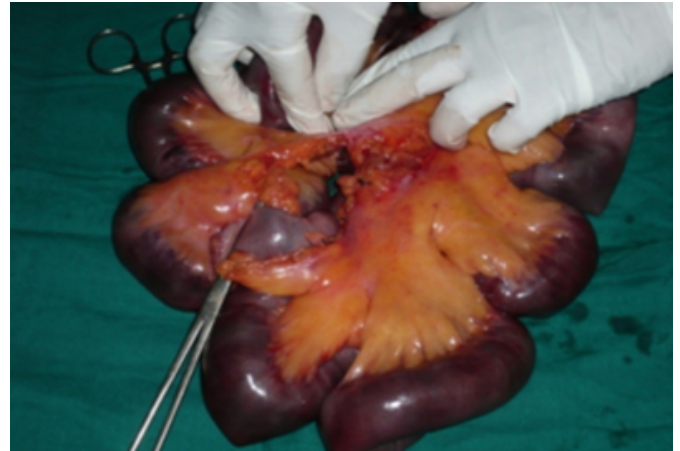
Figure 3: Small bowel gangrene

Post-operatively, the patient developed renal failure and was detected to have brain stem injury. As the poor prognosis was explained to the relatives of the patient, he was discharged against medical advice.