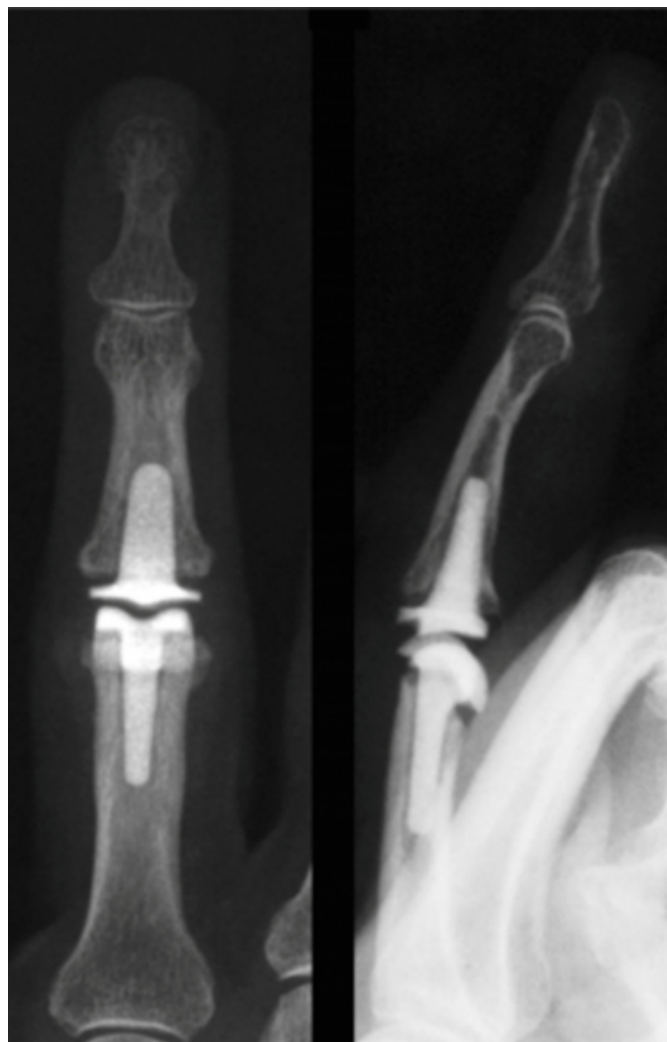
Figure 2b. Postoperative x-rays showing AP and lateral views of left ring finger

Pain scores on the visual analogue scale decreased from the pre-operative average of 7.6 (range 0 to 10) to 1.7 postoperatively (range 0 to 7), which was significant ( p < 0.05 , paired T test). There was a correlation between the level of preoperative pain and the degree of reduction of pain ( p = 0.014 , Spearman's Rho).