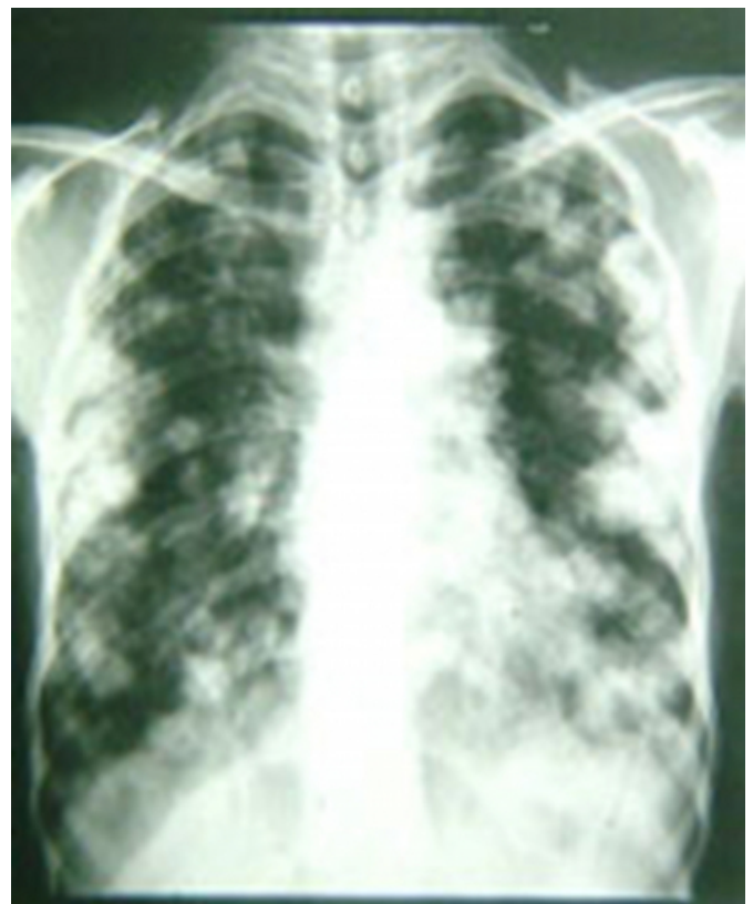
Figure 3. Chest X-ray taken on second admission showing bilateral multiple pulmonary nodules