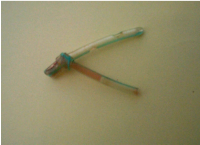
Figure 2: Double knot present in IFT 3 cm from proximal end