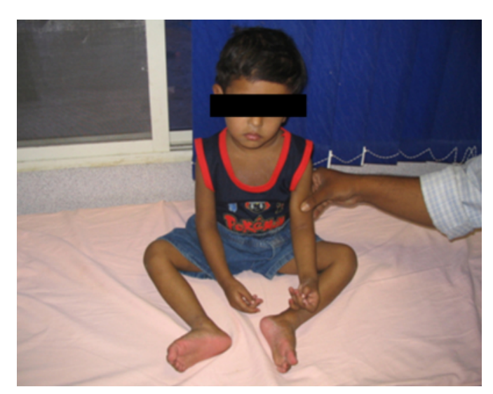
CLINICAL COURSE A diagnosis of Fulminant Sepsis with Disseminated

intravascular coagulation, Multiorgan Dysfunction Syndrome and Acute Renal Failure was considered initially and he was fluid resuscitated with Normal saline boluses. Simultaneously therapy with IV antibiotics {Cefoperazonesulbactum and Ofloxacin – dosages were adjusted according to the calculated GFR}, Dopamine infusion at renal doses & diuretics was initiated. DIC was corrected with fresh frozen plasma transfusion and Vitamin K while dyselectrolytemia was managed with Sodium & Calcium supplements. Within 24 hours of admission, his urine output improved to 2.8 ml / kg / hr {Calculated GFR: 46 ml / min / 1.73 sqm}. Though he was hemodynamically stable, fluctuating consciousness level necessitated a CT scan of brain & neck and CSF analysis.