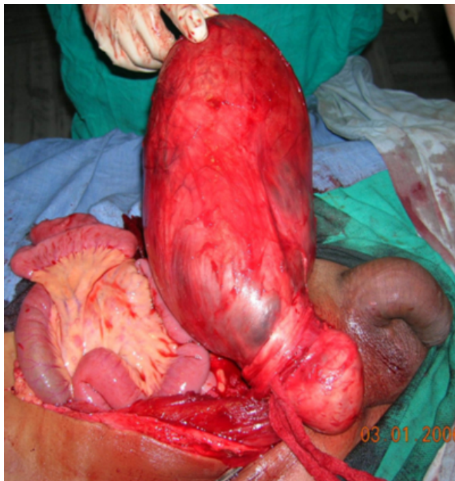
Figure 3: Hydrocele with testis inside

Fluid analysis of the cystic fluid was done. Grossly fluid was amber color. Microscopically Cholesterol crystals were isolated. Tests were positive for albumin and fibrinogen. Specific gravity of the fluid was 1.02. Fluid analysis was coinciding with that of hydrocele fluid. Histopathological examination of the cyst wall suggested collagenous material without epithelial lining or lymphocytic infiltration ruling out possibility of lymphangiomatous cyst or cystic teratoma which are most common differential diagnoses.