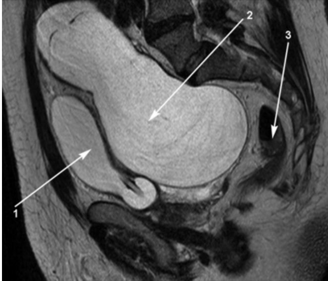
Figure 2: MRI scan of the pelvis with gadolinium contrast, the labels 1, 2 and 3 representing the urinary bladder, the mucocele and the rectum respectively. The state of compression of the bladder neck and prostate is clearly identified.

Its superior margin appeared to be connected to the posterior aspect of the rectus sheath close to the umbilicus and a provisional diagnosis of an urachal cyst was made. At exploratory laparotomy the mass was found to be a large retroperitoneal pelvic cyst containing about 700 cc of mucinous material, with the appendix attached to its dome. This cyst was excised along with the appendix and histology revealed a neoplastic mucocele of the appendix caused by an entrapped tubulovillous adenoma. Subsequent colonoscopy showed no abnormalities. Following this procedure, the patient's voiding dysfunction almost completely disappeared and symptomatically he felt much better.