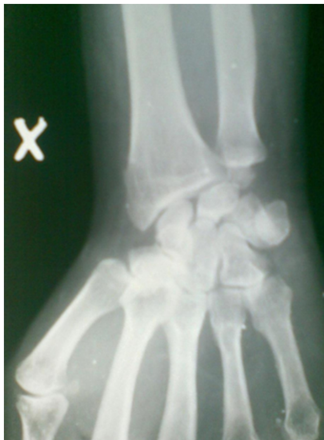
Figure 1: Anteroposterior view of the wrist with laterally placed ulnar styloid