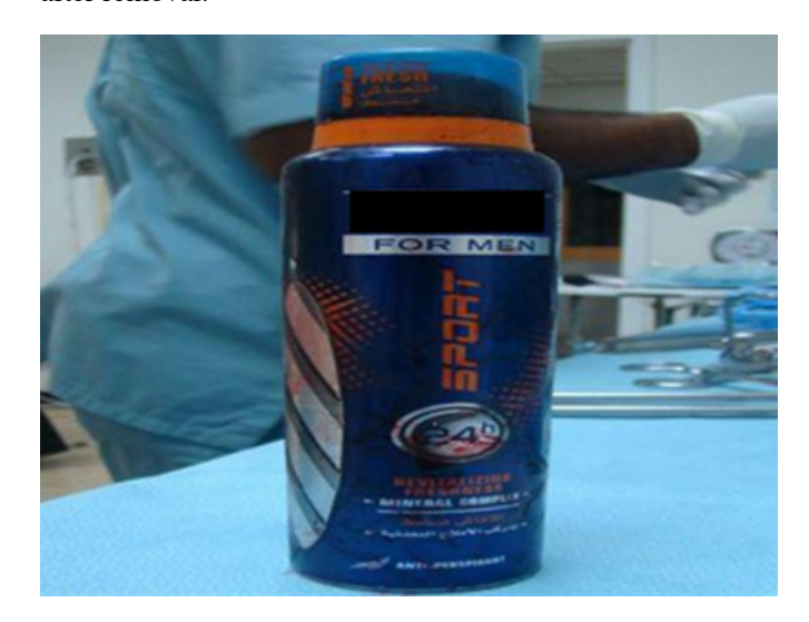
Figure 2 showing the object (Deodorant Aerosol canister) after removal.