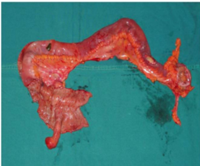
Figure 5: Resected specimen showing lipomatous polypoidal growth from the distal ileal loop.