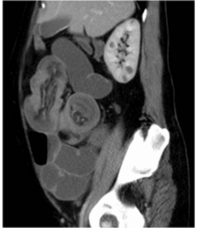
Figure 3: CT sagittal view showing target appearance in the cross sectional view of the intussusception

An explorative laparotomy was performed which showed ileoileal intussusception with patchy areas of gangrene. Limited right hemicolectomy was performed. The gross specimen showed a polyp of 5 x 3cm as the lead point (figures 4 and 5). Histopathological analysis of the polypomatous growth came out as lipomatous polyp with ischemic changes of the ileum without any evidence of malignancy.