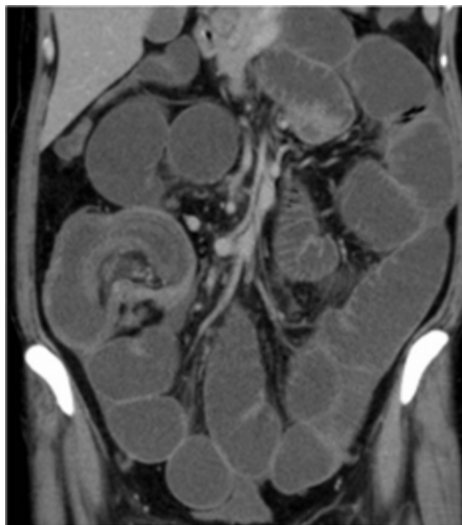
Figure 1: CT coronal view showing multiple dilated small-bowel loops with bowel-within-bowel appearance in distal ileal loops.