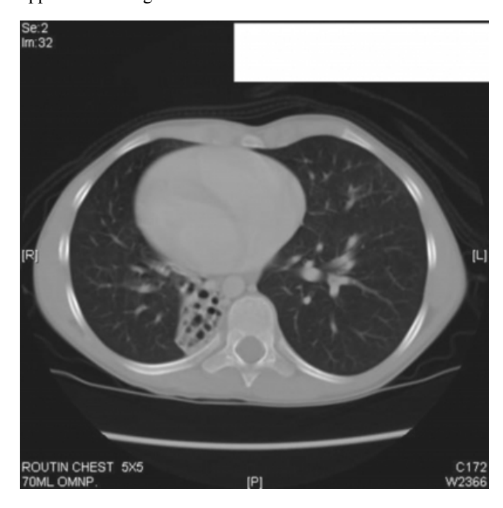
Figure 2 : CT scan of lungs shows the honey comb appearance of right lower lobe bronchiectasis.

Preoperative preparation included antibiotics, incentive spirometry and postural drainage for three days. Premedication was achieved with oral lorazepam two hours preoperatively. In the operation theatre, routine monitoring were established, pulse oximeter, ECG and non-invasive blood pressure. Induction of anesthesia was achieved with propofol 3mg/kg b.w followed by rocuronium 1mg/kg b.w to facilitate endotracheal intubation. Maintenance of anesthesia was achieved with Sevoflurane/O2/Air mixture.