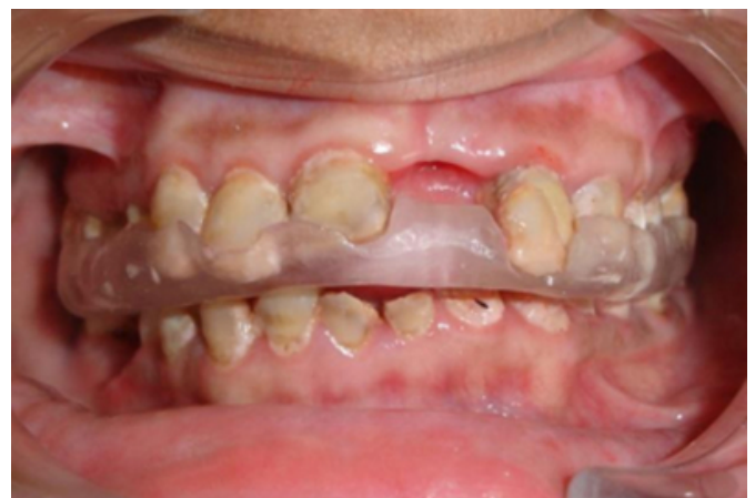
Figure III: Occlusal splint in place

Diagnostic wax-up was done at the established new vertical