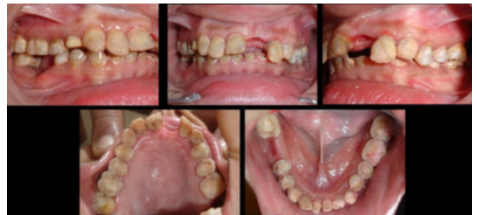
Figure II: Pre treatment intra-oral photographs after extraction