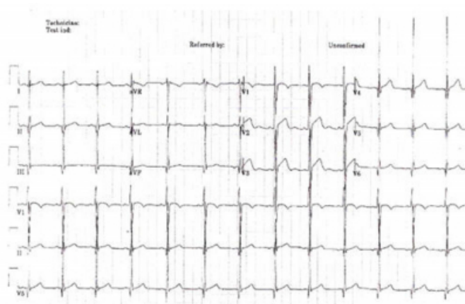
Figure 2: Electrocardiogram of the twin brother