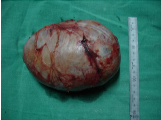
Figure 2: Resected specimen of pheochromocytoma.

On cut section, surface was yellow and variegated with widespread area of hemorrhage and necrosis. Microscopic examination revealed it to be pheochromocytoma (Fig 3) with minimal cytological pleomorphism.