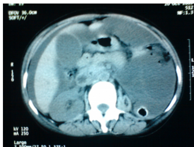
Fig.1. C.T. Scan showing left atrophic kidney and massive free fluid

On opening up the abdomen, 2 litres of pus was drained. A fistula between terminal part of ileum and uterus was noted [Fig.2.]. Total abdominal hysterectomy and bilateral salpingo-oophorectomy with resection of involved ileal