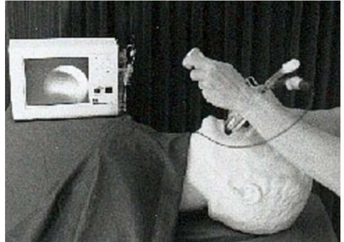
Fig. 2: The monitor display shows the video-view from the bronchial tube tip during conventional laryngoscopy (A) and during advancing the DLT down the trachea (B).

The VOIS is removed, the tracheal cuff inflated and the DLT connected to the anesthesia respirator. Then, the video-optical intubation stylet is inserted into the tracheal lumen and the bronchial cuff is inflated and controlled for proper position below the tracheal carina. During left-sided one-lung ventilation (OLV), the VOIS is left in the non-ventilated tracheal lumen to monitor continuously correct position of the bronchial cuff.