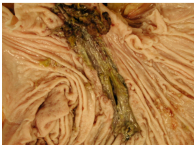
Figure 3: Gross pathology specimen showing colonic perforation 3.5cm from the clips.