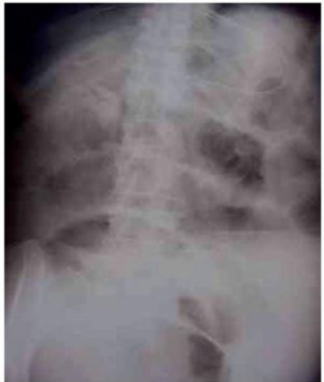
Figure 1: Flat-plate Abdomen