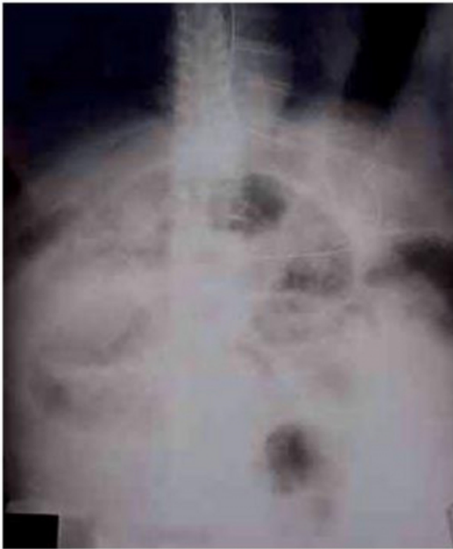
Figure 2: Upright Abdomen

With an associated fever of 38.5° C an abdominal computed tomography scan was obtained. [Figures 3 & 4]