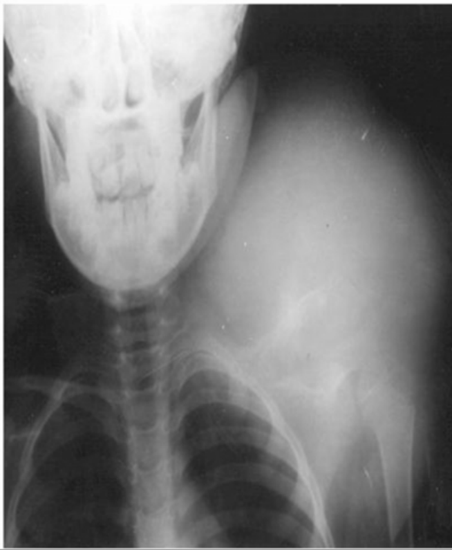
Figure 2: Radiograph of the patient showing the expansile lesion of the left clavicle

CT Scan of the chest revealed two subpulmonic metastatic nodes. A core biopsy from the lesion revealed histopathology compatible with a telangiectatic osteosarcoma (Fig.3).