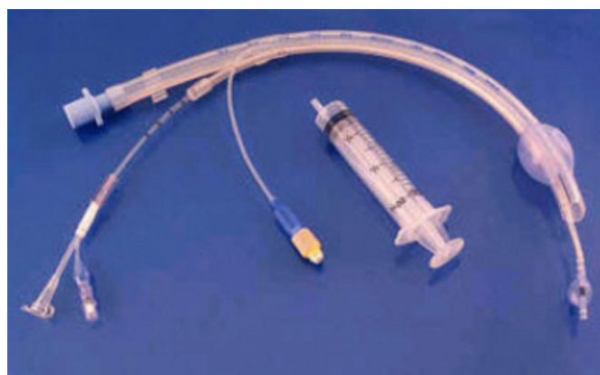
Figure 1: The Univent tube

Following conventional endotracheal intubation, one-lung ventilation (OLV) can be provided by advancing the bronchial blocker into the non-ventilated lung (either blindly or preferably aided by a fiber-optic bronchoscope (FOB)), and inflating the blocker cuff. The Univent tube is marketed in 0.5-mm increments from I.D. 6.0 mm to 9.0 mm and now pediatric sizes are also available. It can be used as an alternative to the double lumen endotracheal tube (DLT) for providing OLV in most of the same clinical applications. The Univent tube is preferred to a conventional DLT for surgical procedures where lengthy post-operative mechanical ventilation is anticipated [3]. The Univent tube may be left in place at the end of the procedure (with the blocker fully retracted and secured), thus avoiding a potentially dangerous change from DLT to SLT. In addition, the larger I.D. 8.5 and 9.0 Univent tubes can be used during procedures where diagnostic bronchoscopy (requiring the larger FOB with a forceps channel) is performed prior to OLV [4].