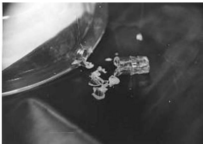
Illustration. 3: Cracked venous outlet of a used oxygenator after coming into contact with an etheric volatile anesthetic agent

Test 4: The base of the venous reservoir of all the used and the new oxygenators cracked.