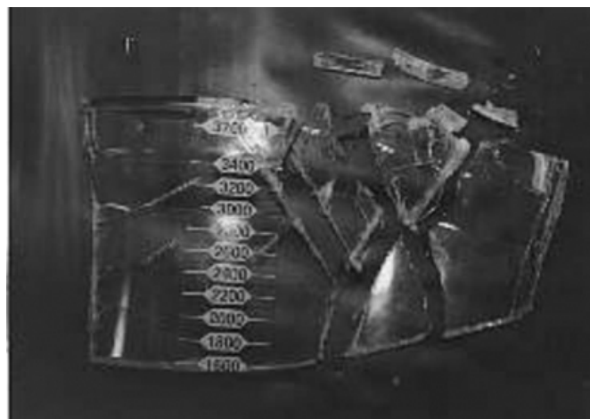
Illustration. 2: Polycarbonate cracked by etheric volatile anesthetics after forced bending

Test 3: Within seconds of coming into contact with either of the two anesthetics, visible cracks formed in the venous