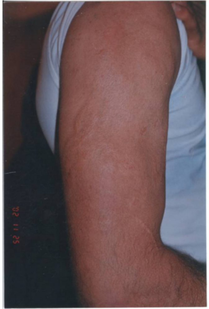
Figure 3: The patient 6 months following Layered dermabrasion. Excellent scar quality, with complete loss of definition of the previous patient tattoo.

Postoperative complications did occur in dark skin colored patients in which hypertrophic scarring rate were less than 8 % in two patients. Whereas, four patients (14%) experienced permanent hyper pigmented derma-braded skin. Incomplete removal of all tattoos pigments in the skin did occur in only one patient (4%) of which another session of layered dermabrasion was performed after 6 months from the initial procedure.