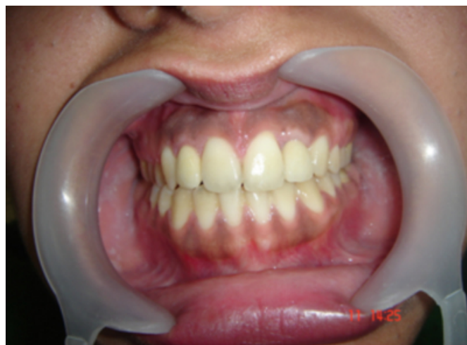
Figure 4: Intra oral view of case 3 in 1 year follow up