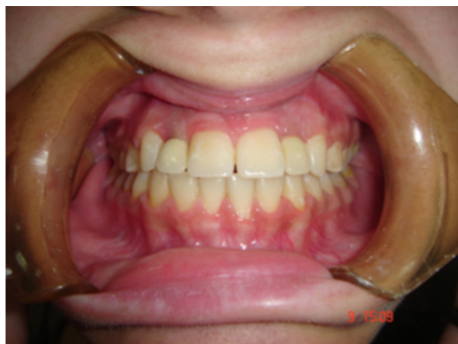
Figure 5: Post-op 1 year view of case 1