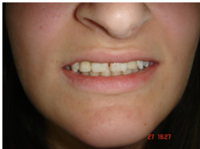
Figure 6: Extra oral view of case 2 in 1 year follow up