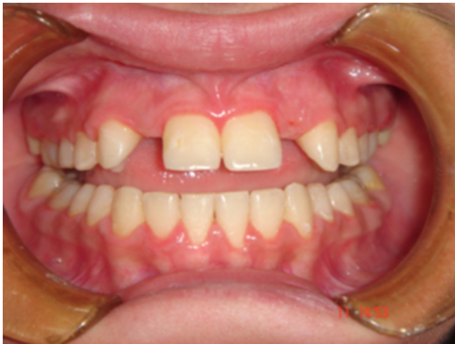
Figure 1: Sufficient space achieved after orthodontic treatment of case 1

In one case, CT radiographic examination showed that bone width in the edentulous region was insufficient. In this case the transfer of chin autograft was decided to apply. Full thickness flap was elevated on the anterior region of the mandible. Dimension of the graft was determined respecting at least 5 mm safety margin below the estimated apices of the frontal teeth in order to protect teeth from any neurosensory disturbances following osteotomy. Two piece of corticocancellous bone block was removed with the help of bone chisel. Blocks were adapted to the recipient graft site with the help of titanium screws. (Fig 2)