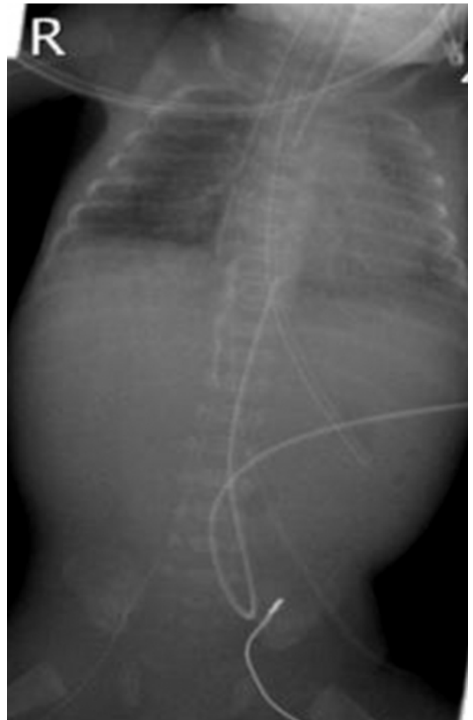
Figure 3: X ray chest and abdomen with 2 nasogastric tubes, first in the right side of the chest and the second in the stomach

No trauma was immediately evident during any of the procedures in either of the babies. Both of these cases of oesophageal perforation were asymptomatic, diagnosed incidentally, treated conservatively and made complete recoveries.