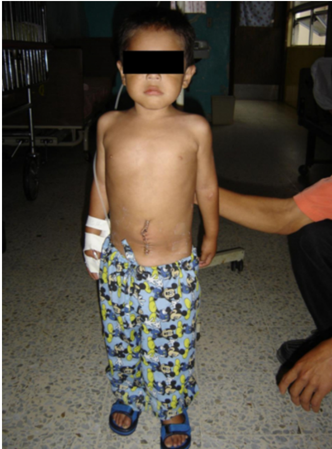
Figure 4: Postoperative period of paediatric patient after ascaris extraction by enterotomy.