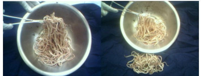
Figure 3: Pool of extracted ascaris of the intestine by means of enterotomy.

The maneuvers of milking and displacement of the ascaris toward the caecum is failed by the compact package of the parasites. Enterotomy was decided to carry out from where hundreds of ascaris were removed.