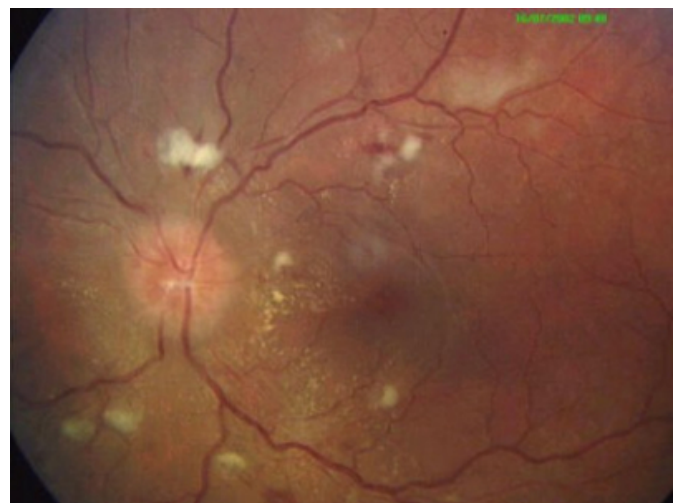
Figure 1: Fundoscopy revealing grade IV hypertensive retinopathy (Keith-Wagener-Barker Classification) as evidenced by papilloedema with grade III changes: cotton wool spots, hard exudates (macular starring), and flame haemorrhages

2. Describe the changes on the ECG (Fig 2) and what are these features consistent with?