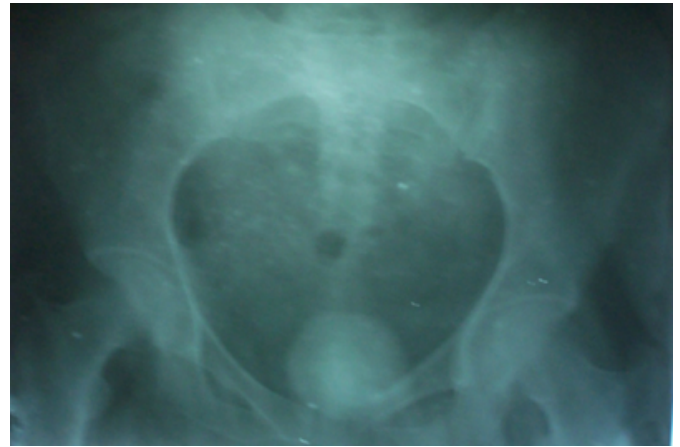
Figure 2: Photograph bladder stone formed over copper-T IUCD. (Vertical limb of IUCD can be seen protruding out of stone)

The intact copper-T was extracted after breaking the stone. The postoperative course was uneventful and the patient was discharged after one week. The patient came for weekly follow up for 2 months and is currently asymptomatic.