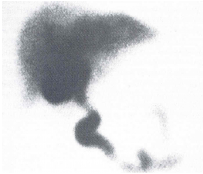
Figure 3: 99mTc HIDA scan view showing normal functioning of the anastomosis 5 years after the operation.