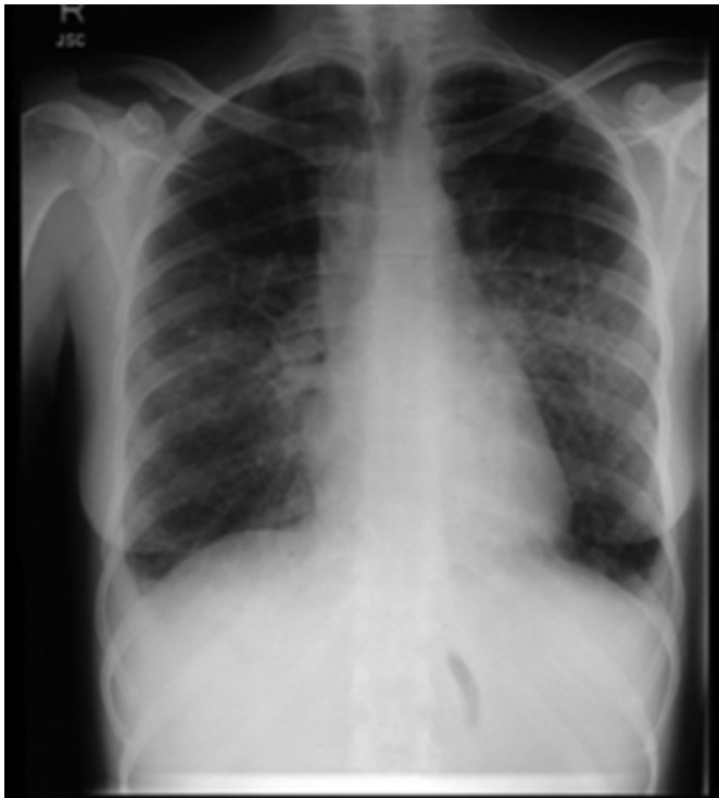
Figure 1: Chest x-ray showing hilar and mediastinal lymphadenopathy with lung infiltration.

She was commenced on intravenous ceftazidime and ciprofloxacin. CT scan of her cervical region and chest revealed enlarged deep cervical, axillary, bilateral hilar and mediastinal lymph nodes. Also there was small bilateral pleural effusions and ground glass appearance of both lung fields more pronounced on the left side (figure II). An abdominal CT scan showed mild splenomegaly.