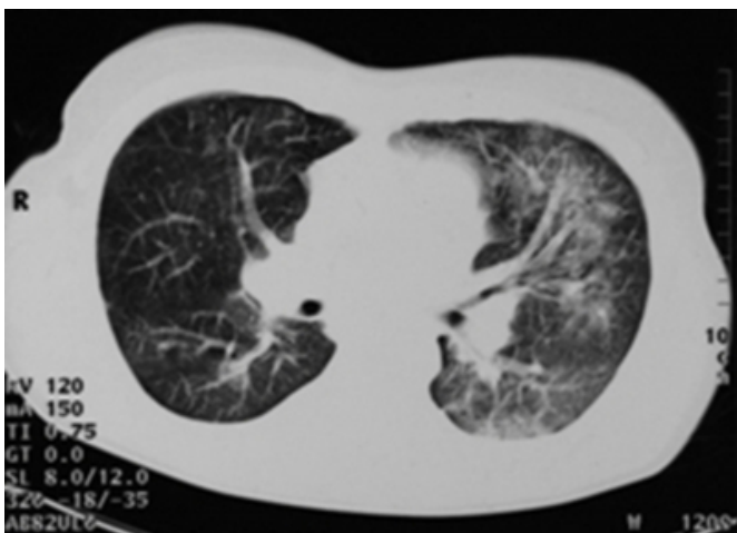
Figure 2: CT chest showing, mediastinal lymph nodes and ground glass appearance of both lung fields.

Differential diagnosis at this stage included an infective cause, sarcoidosis, connective tissue disease or lymphoma. Multiple investigations were carried out and the results were as follows. Repeated blood cultures were negative. Sputum samples did not reveal acid and alcohol fast bacilli and the culture results were negative. Mycoplasma IgM, legionella serology and urinary legionella antigen tests were also negative. EBV IgM, CMV IgM, Toxoplasma agglutination test, serology for parvovirus, measles, rubella, chlamydia pneumoniae, influenza A, influenza B, adenovirus, herpes simplex virus, human herpes virus 6 and 8 were negative. Serum calcium and ACE levels were normal. ANF, ANCA, ds DNA and complement screen were also normal.