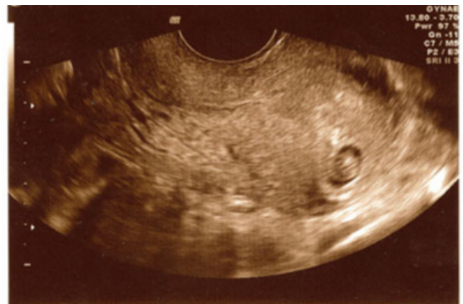
Fig (1) A two dimensional ultrasound image shows the eccentric location of the gestational sac with the foetal pole inside