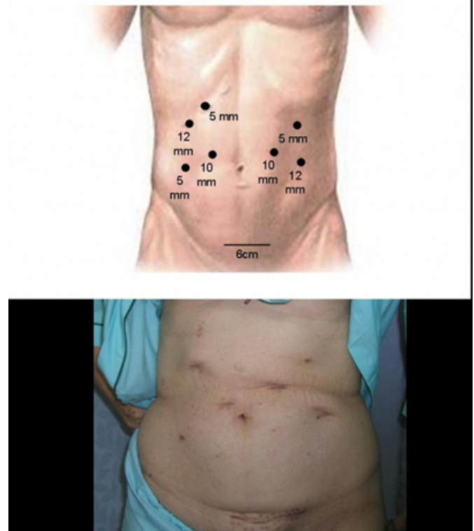
Figure 3: Schematic diagram and photo showing port site positions and specimen extraction incision.

Total operative time was 430 minutes and subsequent postoperative recovery was uneventful. Blood loss was estimated to be less than 500 mls. Pre and postoperative haemoglobin levels were 12.6 g/dL and 9.5 g/dL respectively and no blood transfusion was required. The immediate post-operative pain score was 6 on a pain analogue scale of 0 to 10. This decreased to 3 and 0 on day 1 and day 2 respectively, using oral analgesia including paracetamol and codeine phosphate. Haemodialysis was resumed on day 1. Ambulation was started on day 2 and normal diet resumed on day 3. Drain volumes varied from 90 to 390 mls of bloodstained fluid and the drain was removed on day 5. Subsequently, the patient was fit for discharge.