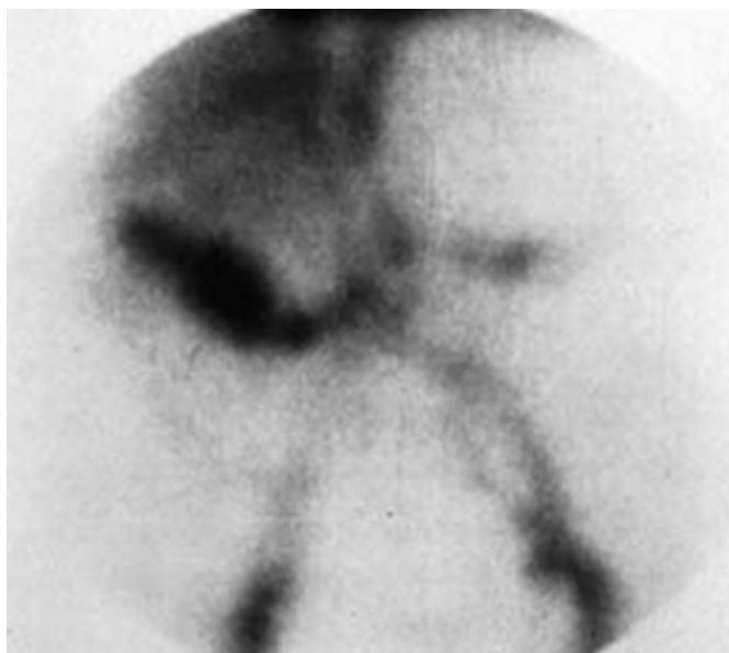
Figure 2: 99mTc-labeled RBC scintigraphy with localization of bleeding in the right lower quadrant.

Subsequent colonoscopy revealed ulceration in the cecum with mild oozing and surrounding mucosal changes consistent with resolving ischemic colitis, which was confirmed by biopsy. The area of suspected hemorrhage was injected with an epinephrine preparation with therapeutic success. The subsequent hospital course was uneventful.