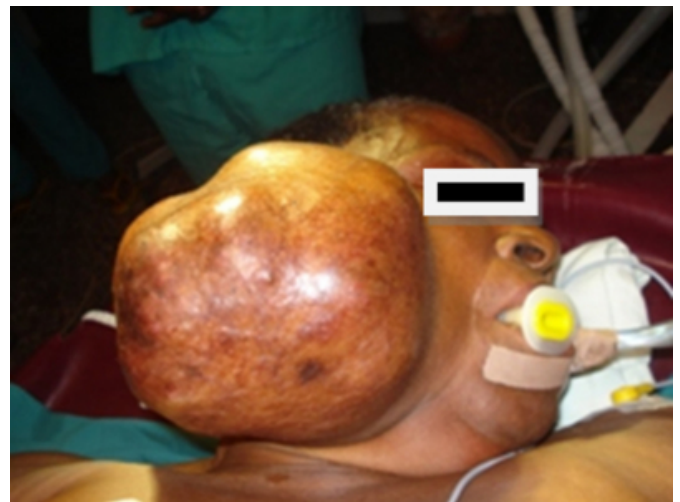
Figure 3- Patient under GA, ET Intubation